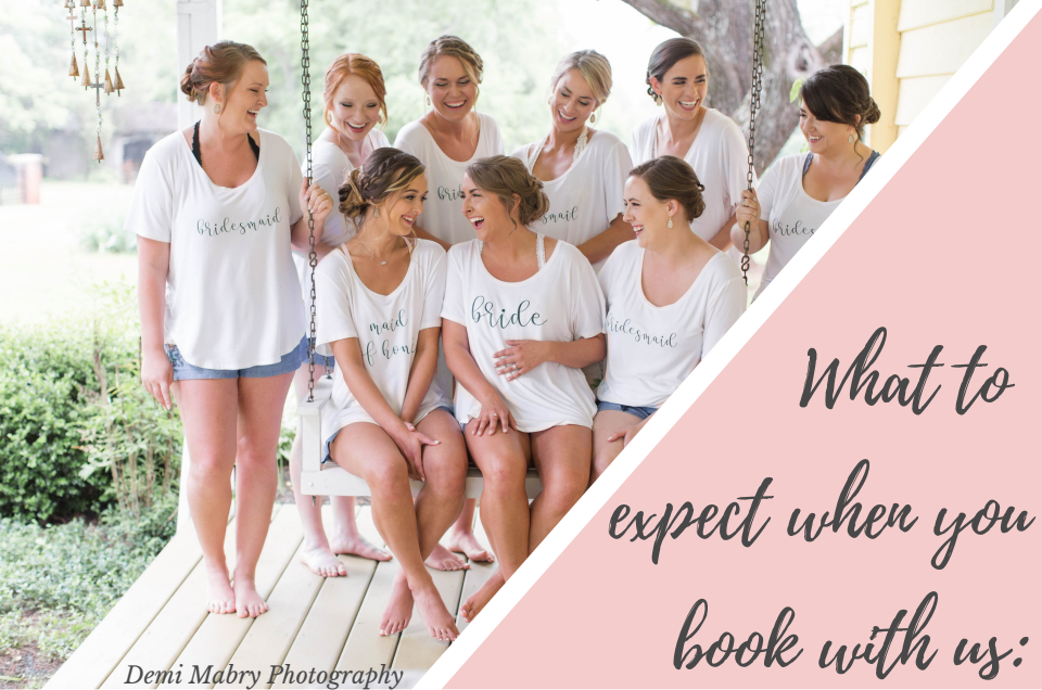
Demi Mabry Photography